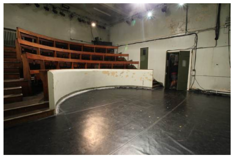
Stage: 7.8m x 3.7m with 5.3m x 2.3m thrust on flat floor. Covered in black vinyl dancefloor. Height: 6.0 m max clearance.

Similar seating to the Anatomy Lecture Theatre, but with a completely different atmosphere: the Demonstration Room is a stark and uniquely atmospheric space that gives audiences a powerful experience before the work even starts. There are 5 aerial points in the space, plus ground level points suitable for Chinese pole. Capacity: 58. There is unstepped access to this space.