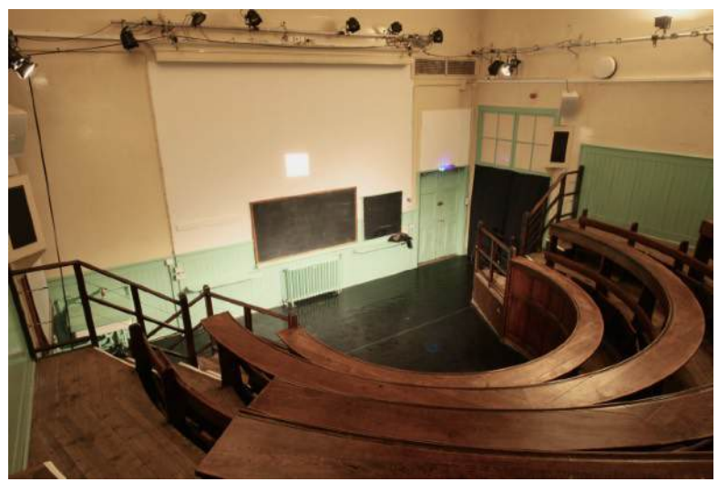
Stage: 8.30m x 2m stage with 3.4m x 3m thrust. On flat floor covered in black vinyl dancefloor. Ceiling: 4.4m clearance.

An intimate room with a raised wooden horseshoe seating area. As well as offering a special atmosphere, it's also a very functional performance and storytelling space, not least for the immediacy brought about by the height of the rake: actors tend to be at eye level with the front row. Capacity: 58. There is unstepped access to this space.